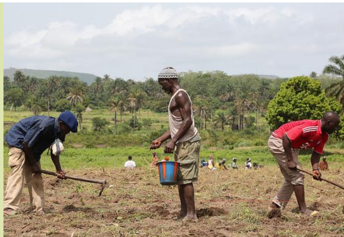
Dominic Chavez / World Bank